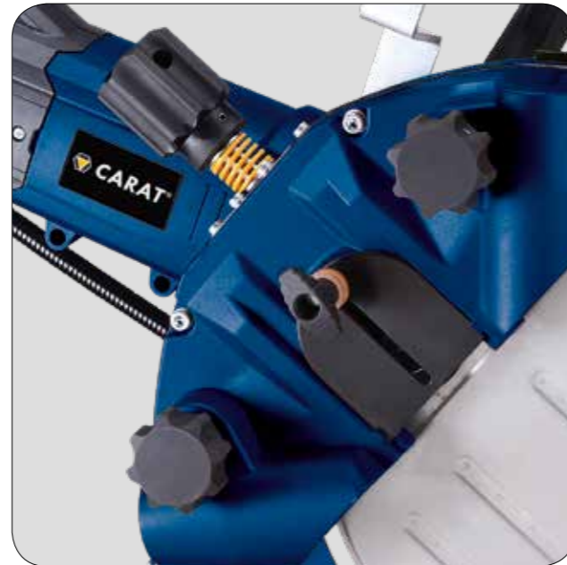
Blades are easy to change.