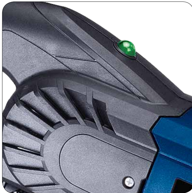
LED indicator shows load conditions.