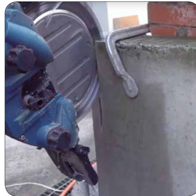
Guide rollers keep the blade stable and centralized when beginning the cut.